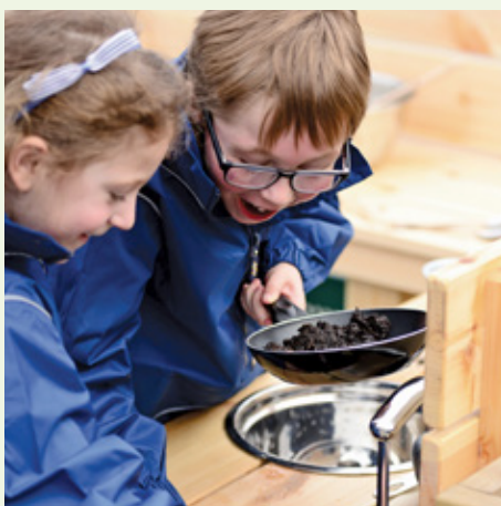
Water Investigations Collection

There are 6 collections with over 500 individual items and all of the storage containers you need to organise your Small Outdoor Store.